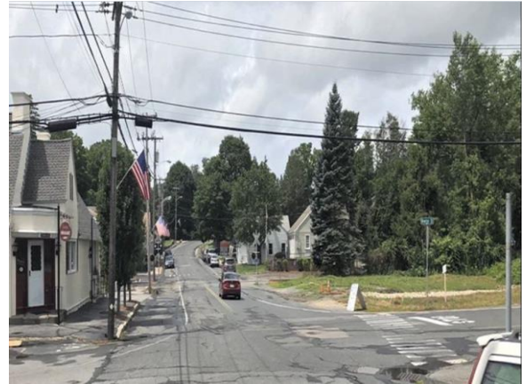
Main Street Southborough 2019